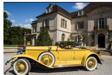
Car from the Great Gatsby

Examples are the Great Gatsby, the Scarlet Letter, and the Lord of the Ring. The Masonic Fraternity uses symbolism to convey ideas. A brief explanation of the hieroglyphical emblems mentioned in the Third Degree Lecture from the Arizona Monitor is given below. These are symbols that should conjure up images in your mind like how various books and movies create symbolism.