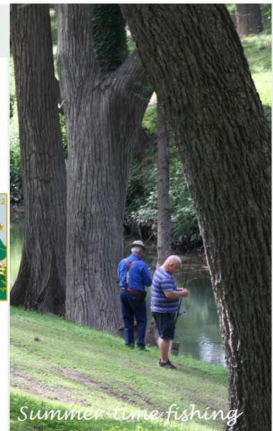
Summer time fishing