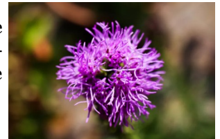
Liatris, also known as blazing star or gay-feather, is a long-blooming perennial