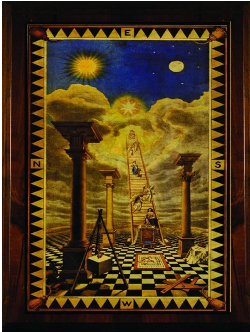
Tracing Board— from the United Grand Lodge of England

for a particular degree would be erased using a pail and mop. Later, these tracing boards were drawn on canvas or boards to save them. This saved aristocratic candidates from using a mop. Thus, commentaries about the death of the pail and mop begin to be published.