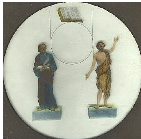
The Holy St. John and the point within a circle

It should be noted that here in Arizona, we still hold our annual communications in the month of June, regardless of how hot it is!