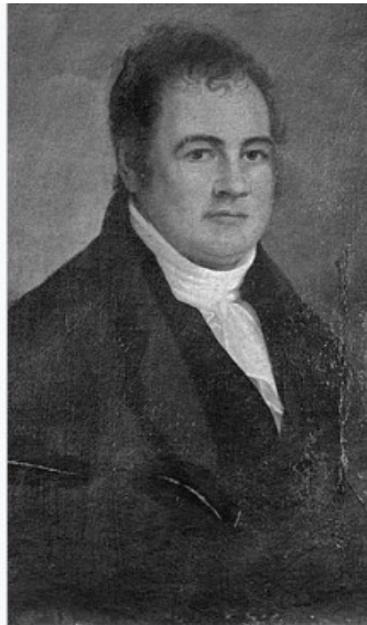
Solomon Southwick, newspaper publisher and 1828 Anti-Masonic candidate for Governor of New York

In 1828 there was an Anti-Masonic fever in much what was then the United States. The thinking of some religious Citizens is where the Masons were too secret, elitist, and a conspiracy plotting to take over the Government. This led to the forming of a new political party, the first serious 3 rd Party of our young country. This new party was called the Anti-Masonic Party.