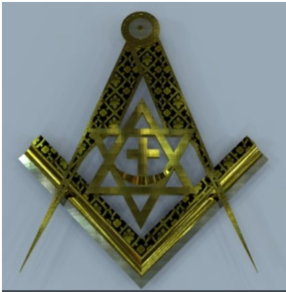
The Seal of the Grand Lodge of Israel.

Grand Lodge of North Carolina October 10 at 3:47 AM · Found on Facebook