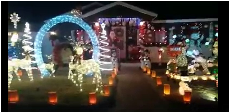
Christmas decorations in Holbrook in 2022.

Take time during the holidays to think about all the wonderful signs of the season. It could enrich your life!